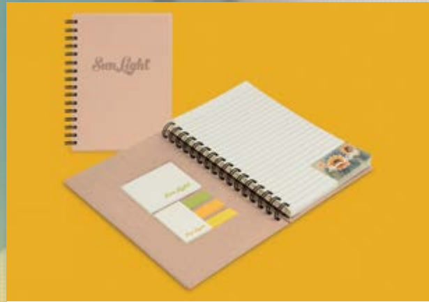
Wire-o sticky notes set in hardcover ECO