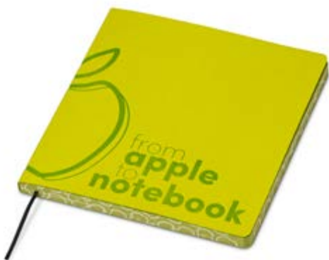
Mindnotes® in Newapple softcover