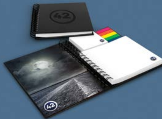
Wire-o sticky notes set in hardcover