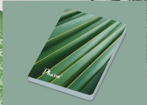
Mindnotes in paper softcover