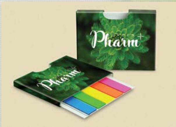
Page flags in softcover