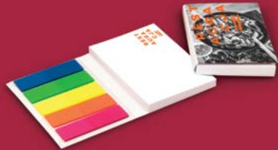
Sticky notes set in softcover