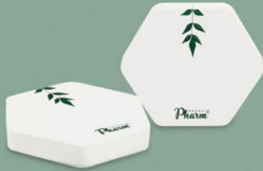
Sticky notes shaped