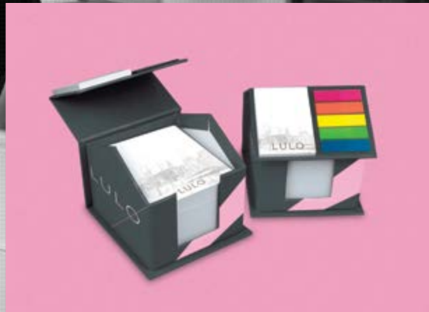
Notes set in hardcover