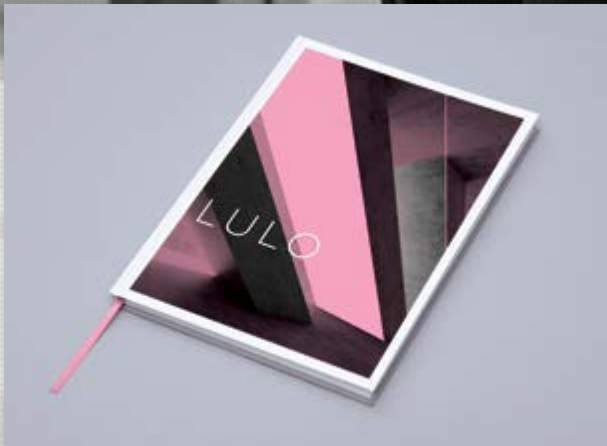
Mindnotes in paper hardcover