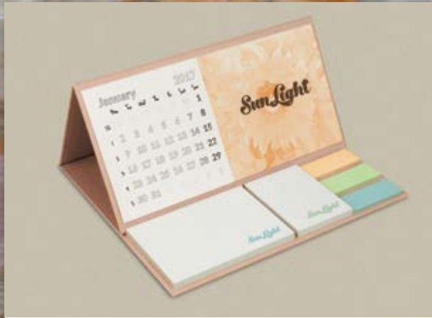
Hardback calendar ECO