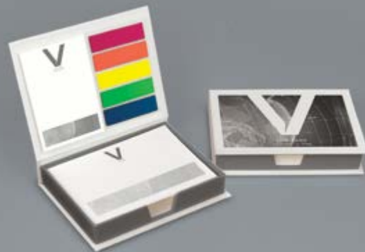
Notes set in hardcover