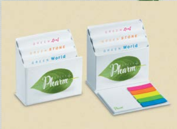
Notes set in hardcover