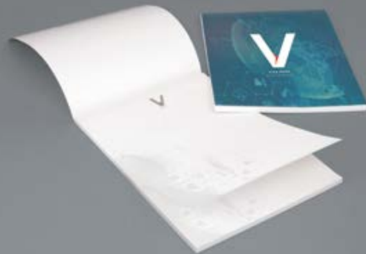
Notepad in softcover

We have good intuition, extensive knowledge and years of experience, so you can be sure your secrets are in good hands!