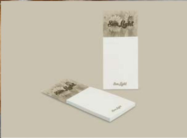
Sticky notes ECO with magnet