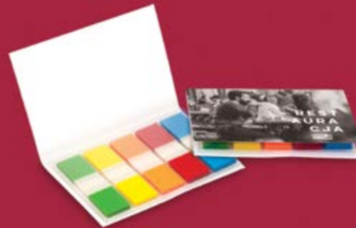
Page flags in softcover