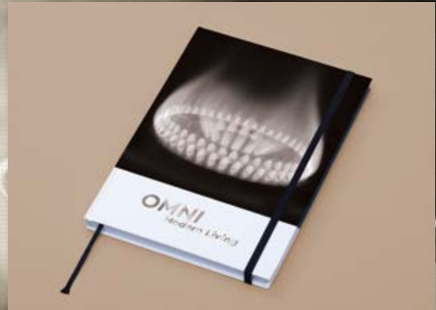
Mindnotes in paper hardcover

In this business reliability is crucial. We will offer you the daily comfort and pleasure of use ... for sure!