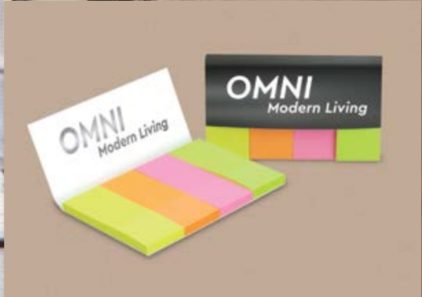
Page flags in softcover