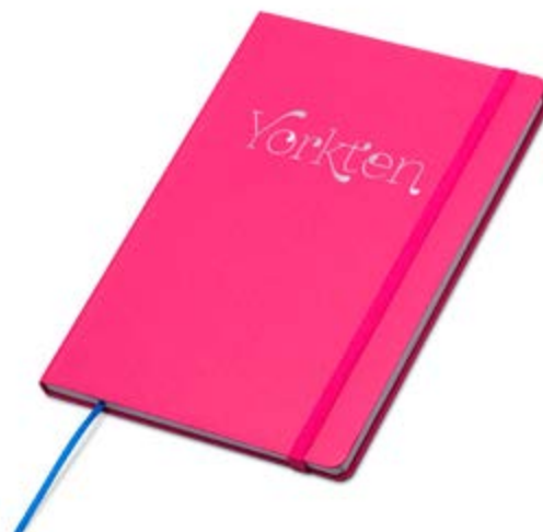
Mindnotes® in ROMA flexi hardcover