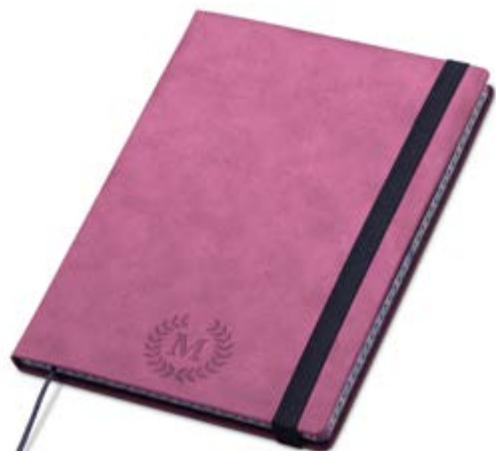
Mindnotes® in FLORENCE hardcover