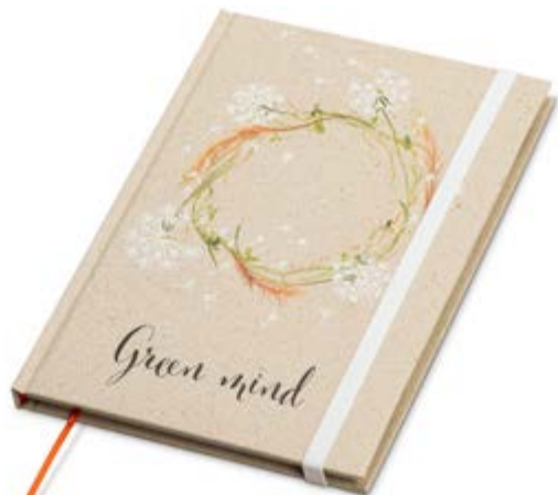
Mindnotes® in grass paper hardcover MN31-GRASS