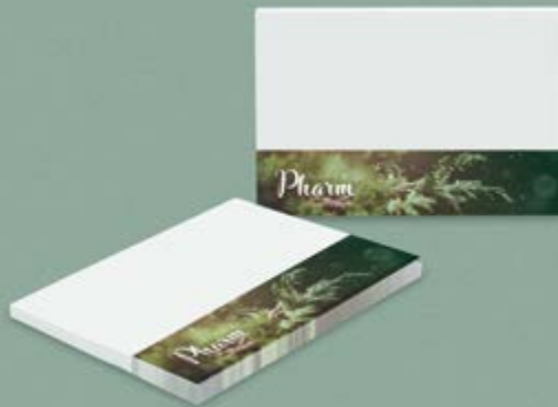
Sticky notes Basic