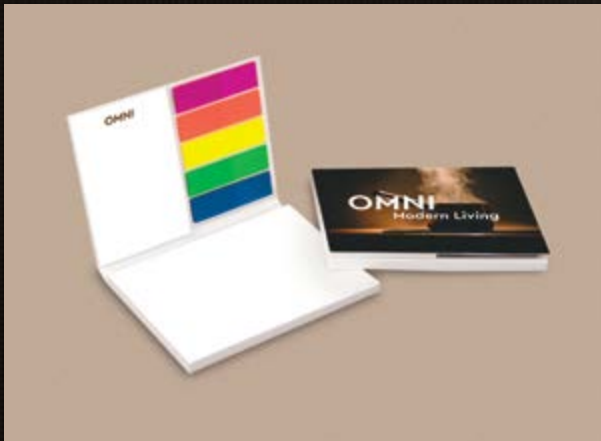
Sticky notes set in softcover