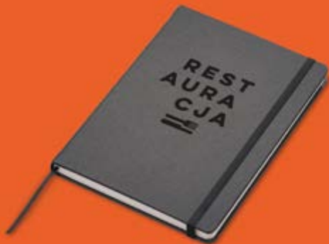
Mindnotes in textile hardcover