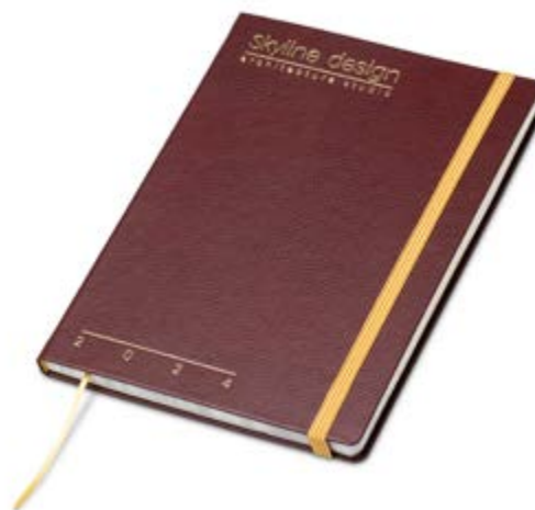
Mindnotes® in Toscana hardcover