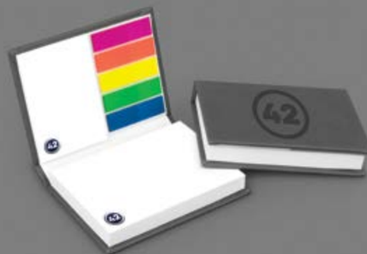
Sticky notes set in PU hardcover