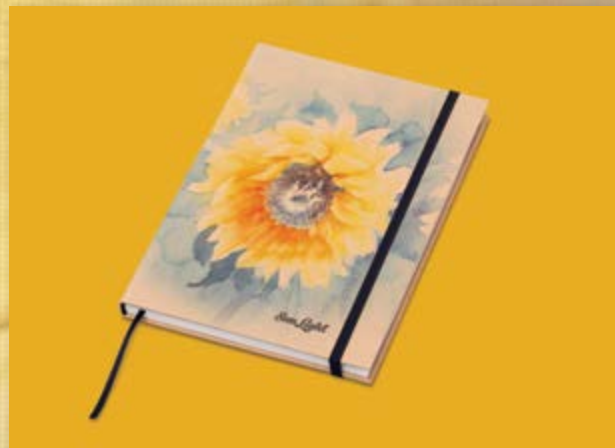
Mindnotes in KRAFT paper hardcover