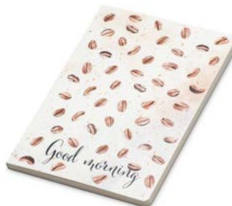
Mindnotes® in coffee paper softcover MN11-COFFEE