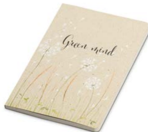
Mindnotes® in grass paper softcover MN11-GRASS