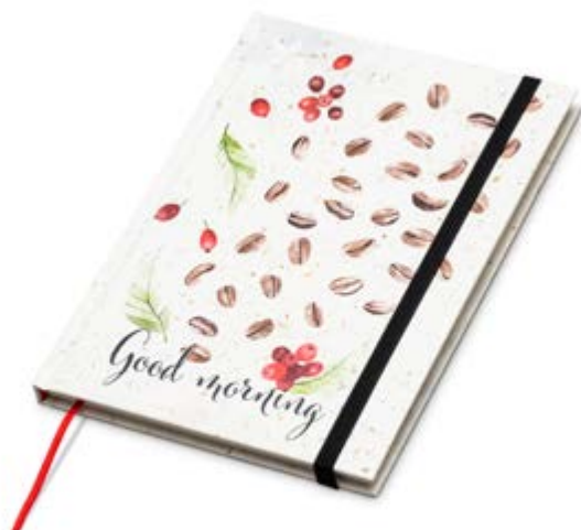
Mindnotes® in coffee paper softcover MN31-COFFEE